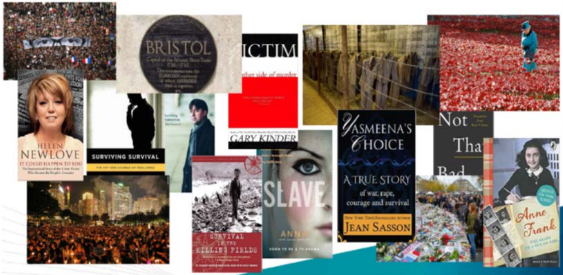
IMAGE 1. A montage of victim story-telling texts and images.

These images aim to provide a visceral representation of the different ways in which victim testimonies are captured and how they can shape our individual and collective sense of identity. Our goal is to chart the cultural conditions that shape these testimonies and seek to understand the value story-telling has for victims. To do this we shall draw on two separate case studies from two different research projects to illustrate how victim narratives provide the basis for resilience through the reconstruction of identity.