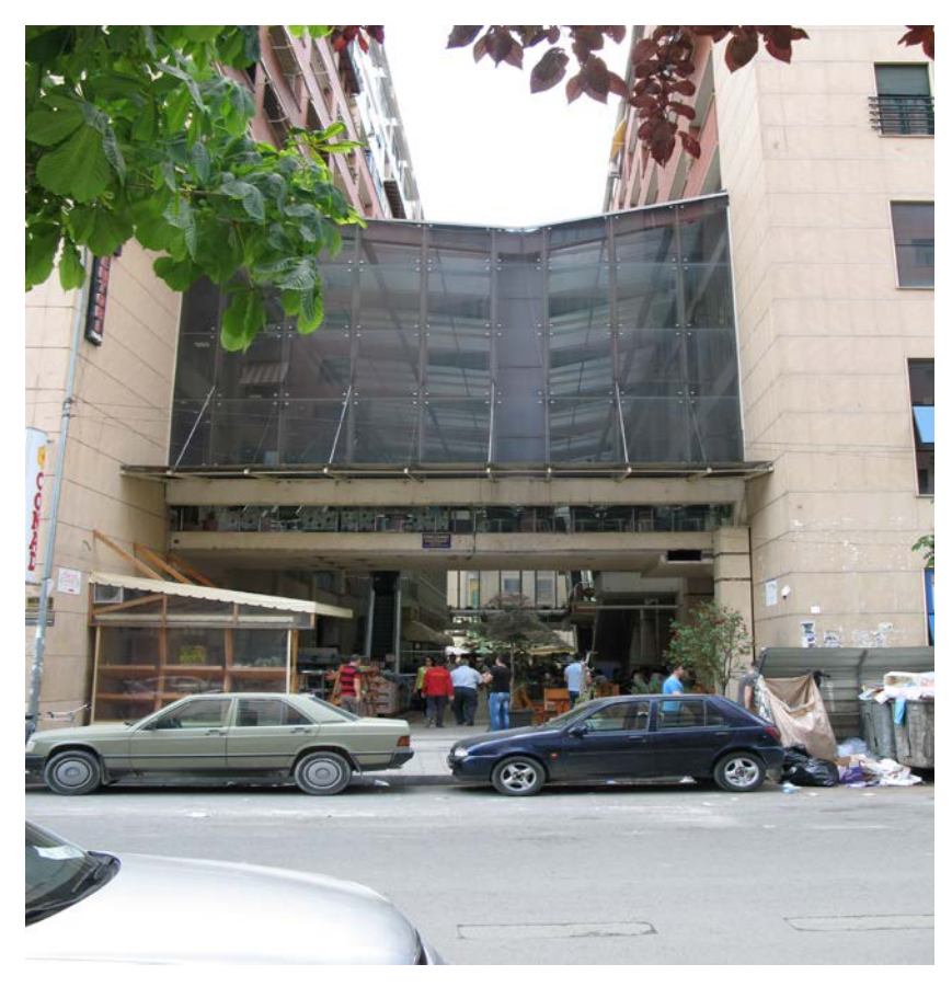
Figure 1. Photograph of shopping centre, Tirana, May 2015.

This image is of a shopping centre in Tirana. It has a ground floor of cafes, bars, and restaurants (including the best pizzeria in Tirana). An escalator takes you up to the second floor, where you find numerous bars and a few shops. The shopping centre is called Gallery Tirana, Former Cinema 17 November Complex. This is the closest to a commemorative plaque. While it is true that the venue used to be a cinema, it is less known that the cinema also functioned as a venue for the show trials carried out during Communist rule in the period 1946-1951 (see Figure 2). The choice of venue was not random. To select the cinema is to appreciate its performative value.